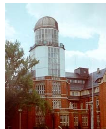
Beyer-Bau (main building of the Faculty of Civil Engineering)