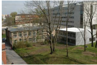
Neuffer-Bau (Institute of Geotechnical Engineering)